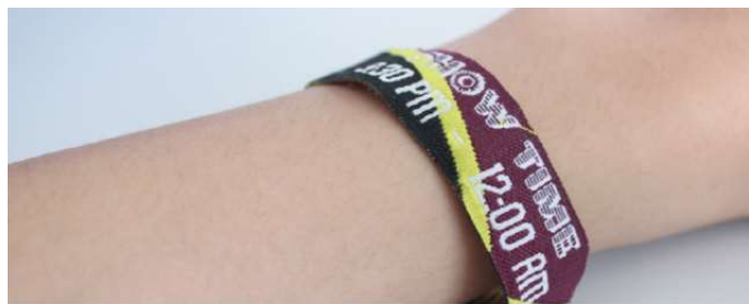
The wristband is adjustable and suitable for different wrist degrees.

Frequency:125KHZ,13.56MHZ,UHF Chip:EM4200/Mifare 1K/Mifare Ultralight/ICODE SLIX/Ntag213/Alien H3/Ultralight EV1/Mifare Plus SE 1K/Desfire/Mifare Ultralight C Protocol:ISO14443/15693/NFC/18000-6C Storage:Depends on the IC chip Read/Write distance:Best tuning antenna for different IC chip Erase cycle:≥100,000 Temperature: -40°C~+60°C Size:350*160mm/350*20mm, 400*16mm/400*20mm Waterproof Material: Smart Card+Fabric Wristband/Woven Wristband Smart Card : Hard PVC Or Soft PVC Fabric Wristband: Full Color Print Fabric(2 sided print optional);